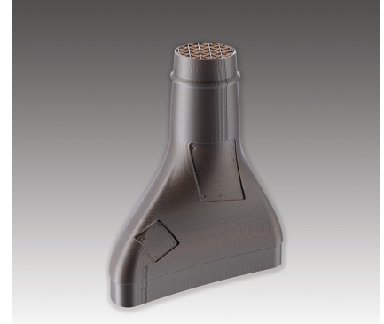
Figure 1: FDM sacrificial tooling begins with a 3D printed tool, which features a standard fill pattern designed to promote fluid flow during the tool removal process and provide adequate strength during elevated temperature, high pressure cure cycles.

Fine details. Smooth surface finishes. Accuracy. Strength. The best way to see the advantages of a Fortus 3D Printer is to have your own part built on a Fortus system. Get your free part at: stratasys.com .