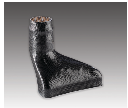
Figure 2: The composite material is then wrapped around the sacrificial tool as shown. Once the part is fully formed and cured, the tool is ready for wash-out.